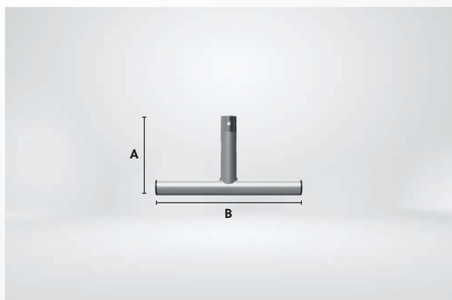
Drop Arm T-Joint