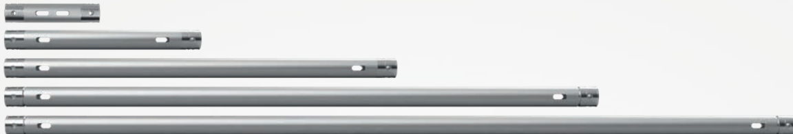
Extension Tube L-Frame 250/2000mm

To create height or longer frame space between L-Frame Ladders, you can work with Extensions.